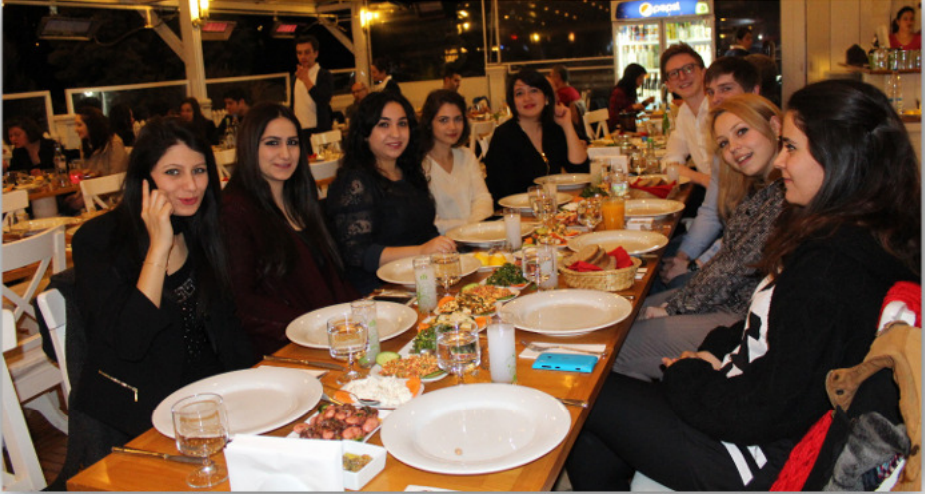
2014-2015 Spring Term - Welcome Dinner