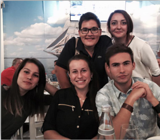
2015-2016 Fall Term - Welcome Dinner